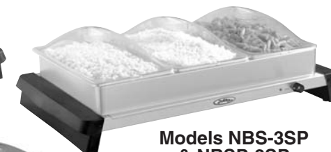
Models NBS-3SP & NBSP-3SP